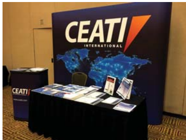
Exhibit and Be Seen

CEATI reserves the unqualified right to make changes in the floor plan or space assignments which may be required owing to unforeseen circumstances.